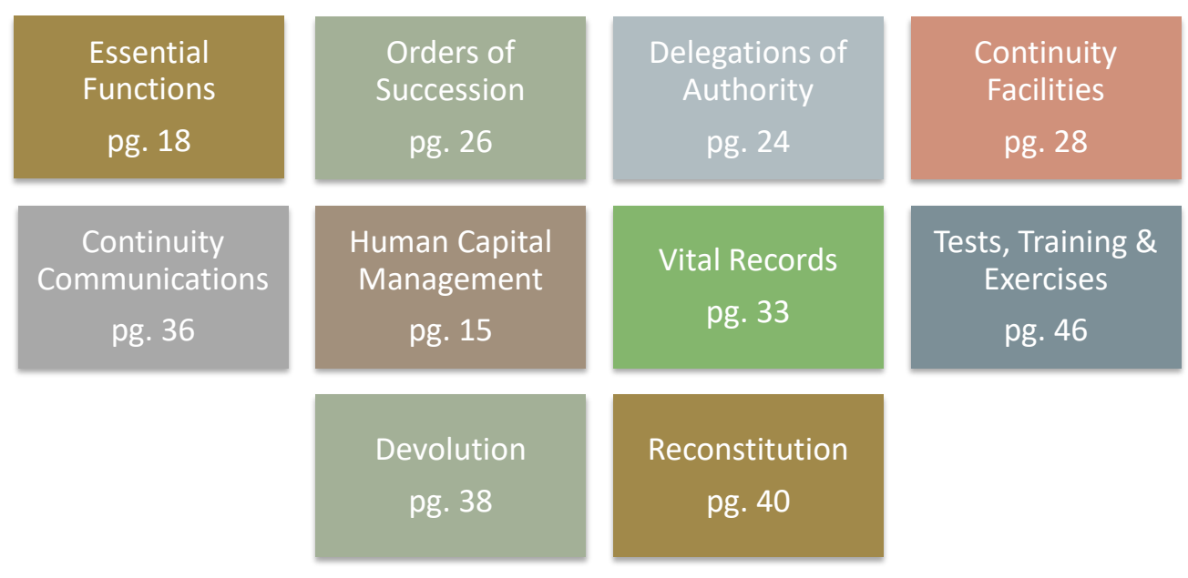
Figure 6-1. Ten essential elements

A viable COOP Plan consists of ten essential elements as identified by FEMA and Cal OES: